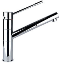
Mixer Tap Lorenzo 8466 000